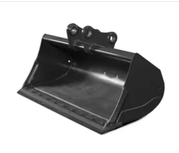
10/10/22, 3:01 PM